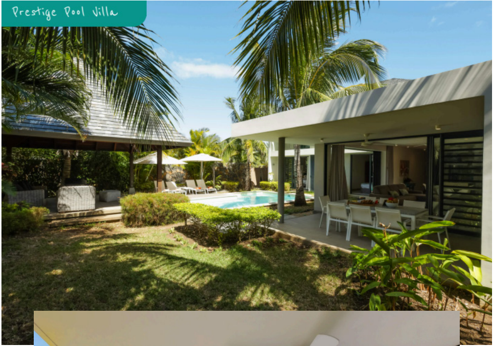
Prestige Pool Villa

RESORT & CONCIERGERY BLACK RIVER - MAURITIUS