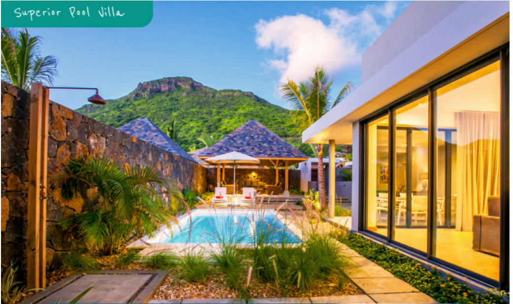
Superior Pool Villa

RESORT & CONCIERGERY BLACK RIVER - MAURITIUS